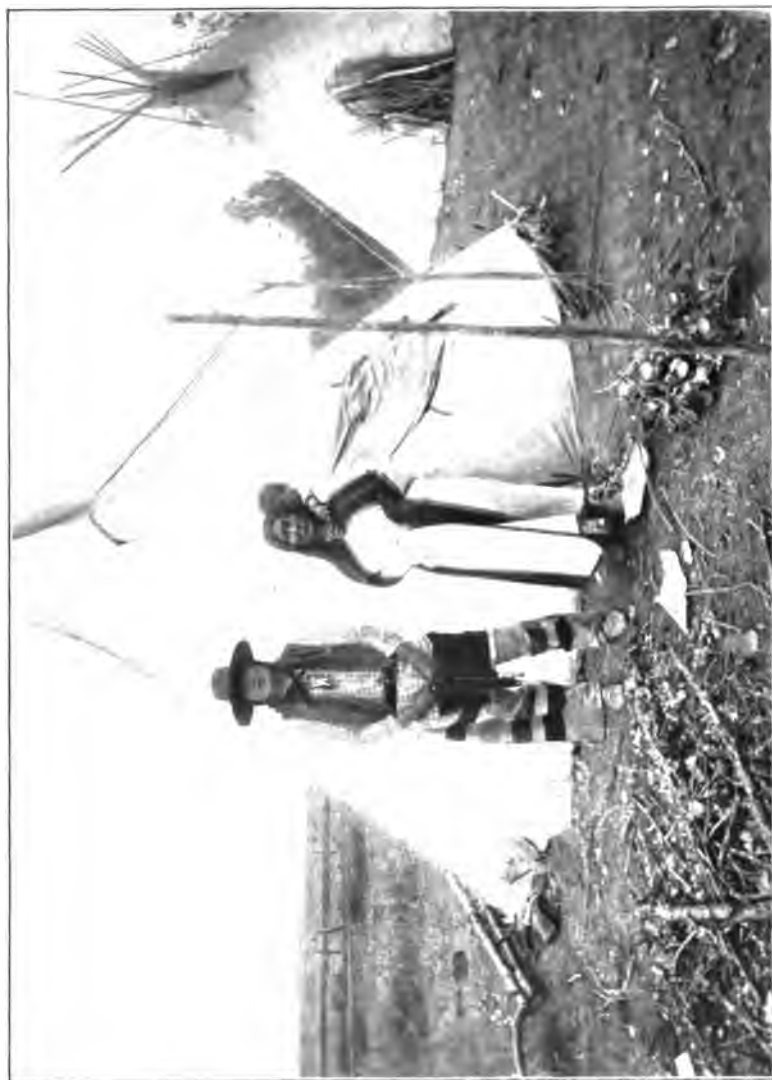
CURLY, A SURVIVOR OF THE CUSTER COMMAND IN THE LITTLE BIG HORN FIGHT, WITH HIS WIFE AND CHILD